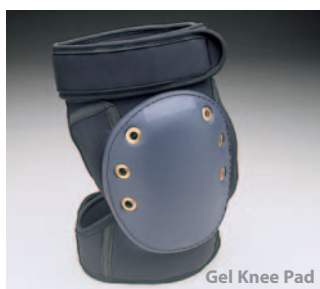
Gel Knee Pad